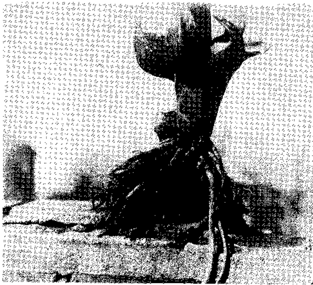
FIG. 1. S. foetidus plant lifted March 1955. The numerous large roots are contractile. Note sheathing base of petiole remaining from 1954 leaf; 3 spathes.

Not all plants produce inflorescences in a given season. Any individual plant may